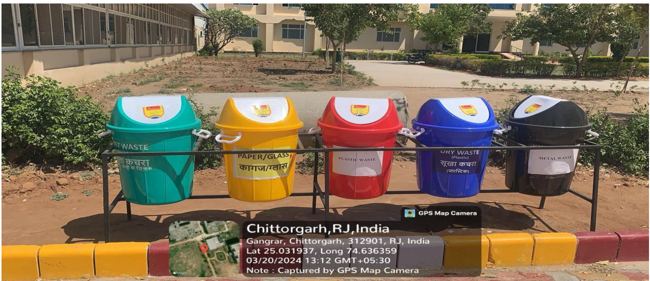
Biodegradable and Non-Biodegradable waste management