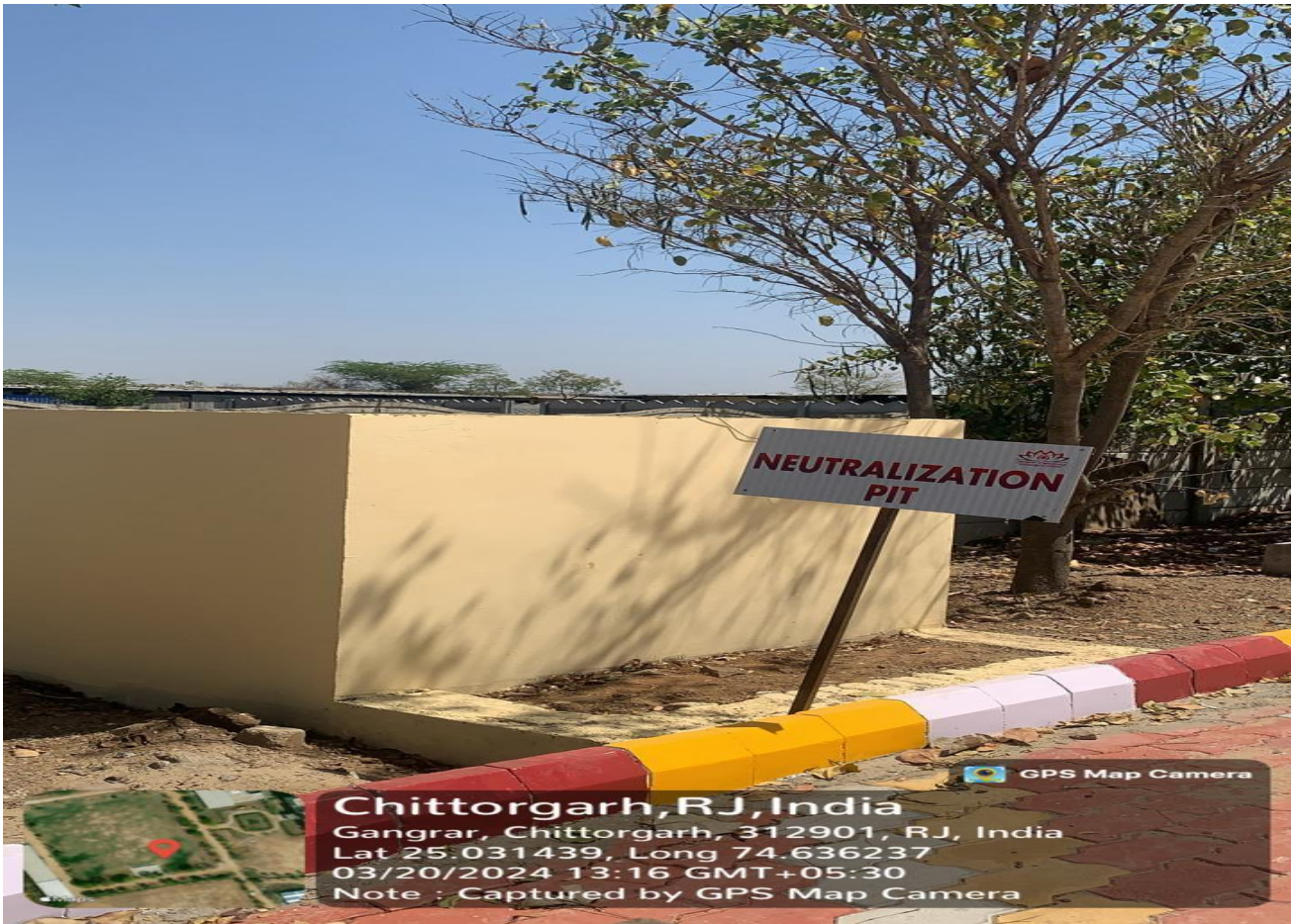
Hazardous Chemical waste management